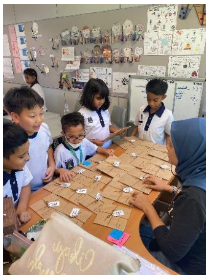
Mystery Book activities. You never know what book you will get!