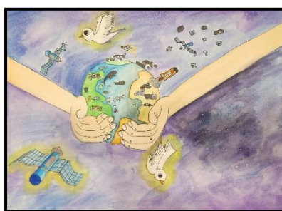
Junior (Upper Primary) Category "Amazing Art Commendation" Award Li Zhuohang | 6 Adaptability