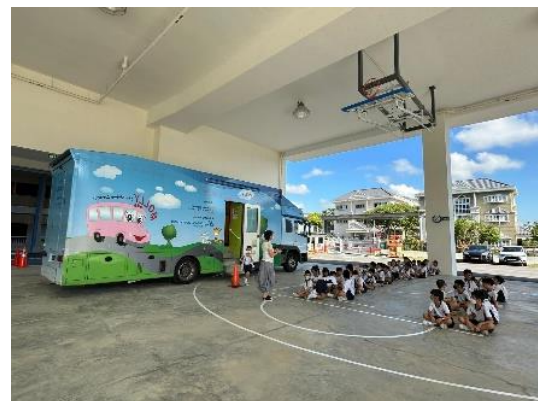
NLB Molly came to spread the reading fun