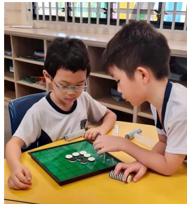
Primary 1 students learning strategic thinking through Reversi.

Through the varied activities conducted by subject departments, students had meaningful experiences where they made discoveries about themselves and rekindled interests and passion for something that they truly enjoy. In the concluding activity, students reflected on their personal experiences on a piece of craftwork. We hope parents had a good conversation with their children about Book-Free Day .