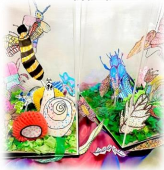
Category A (P1 & P2)