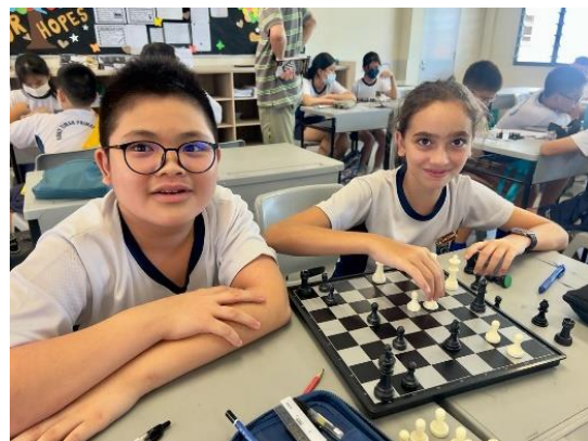
Primary 6 students rekindling their passion for International Chess.