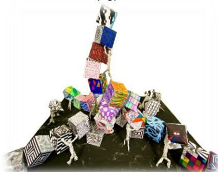
Category C (P5 and P6)