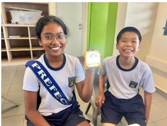
Primary 5 students sharing their contributions to energy conservation.