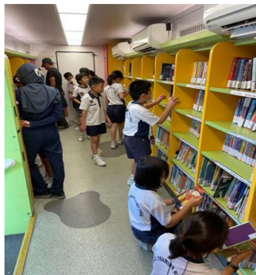
Above: Students in the popular NLB Molly Bus