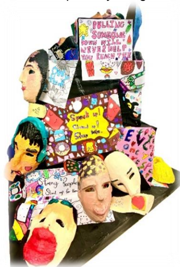
Category B (P3 and P4)