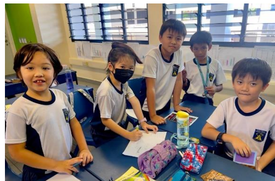
Primary 3 students applying their problem-solving skills in Escape Room!